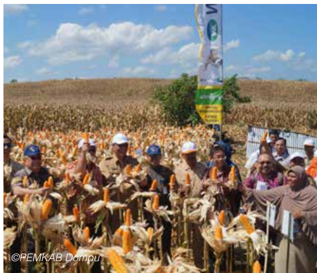
Corn Harvest with OJK’s Vice Chairman, Head of Dompu District, Bank Andara, and BPR Pesisir Akbar Representatives