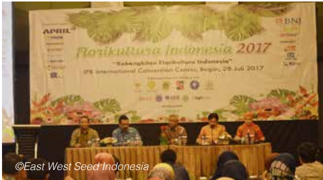
Line up speaker during dialogue session.