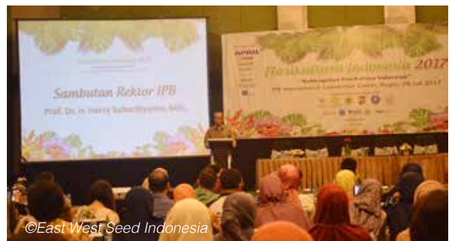
The audience during dialogue session.