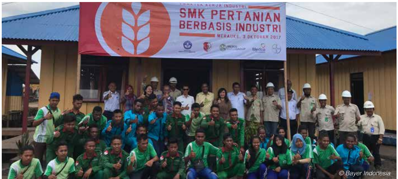
Bayer Indonesia and Medco Papua representatives pose together with vocational students who joined first batch of the program.

MERAUKE, Oct. 5, 2017 -- Medco Group and Bayer Indonesia work together with multi stakeholders to accelerate the revitalization of Vocational High School (SMK) and strengthening the quality of vocational education promoted by the government of Indonesia.