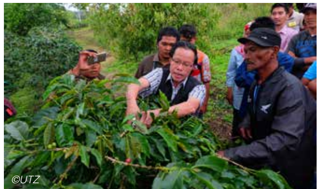
To optimize the learning, most of the training sessions were facilitated through direct practices on the farm.