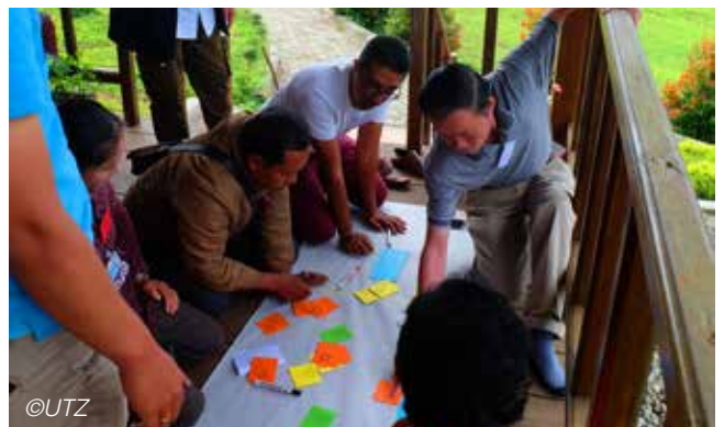
Training method focused on Participatory Approaches which participants were positively pushed to share their experiences.