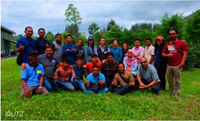
A good learning and sharing on Coffee Good Agriculture Practices have been shared among trainers and participants.