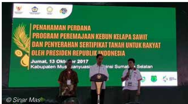
President Joko Widodo kick started the replanting program in Musi Banyuasin regency, South Sumatra province.

Musi Banyuasin, October 13th, 2017- Sinar Mas' smallholder farmers will be taking part in the GOI programme to replant palm trees.