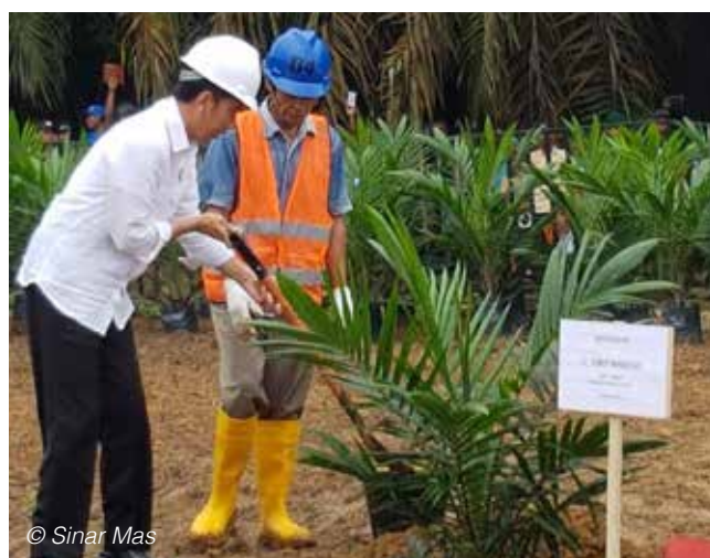
President Jokowi marked the start of replanting programme by planting a young palm oil tree.

Sinar Mas calls on all stakeholders to help address these challenges and believes that better synergy and cooperation between public and private sectors will help ensure the success of the programme.