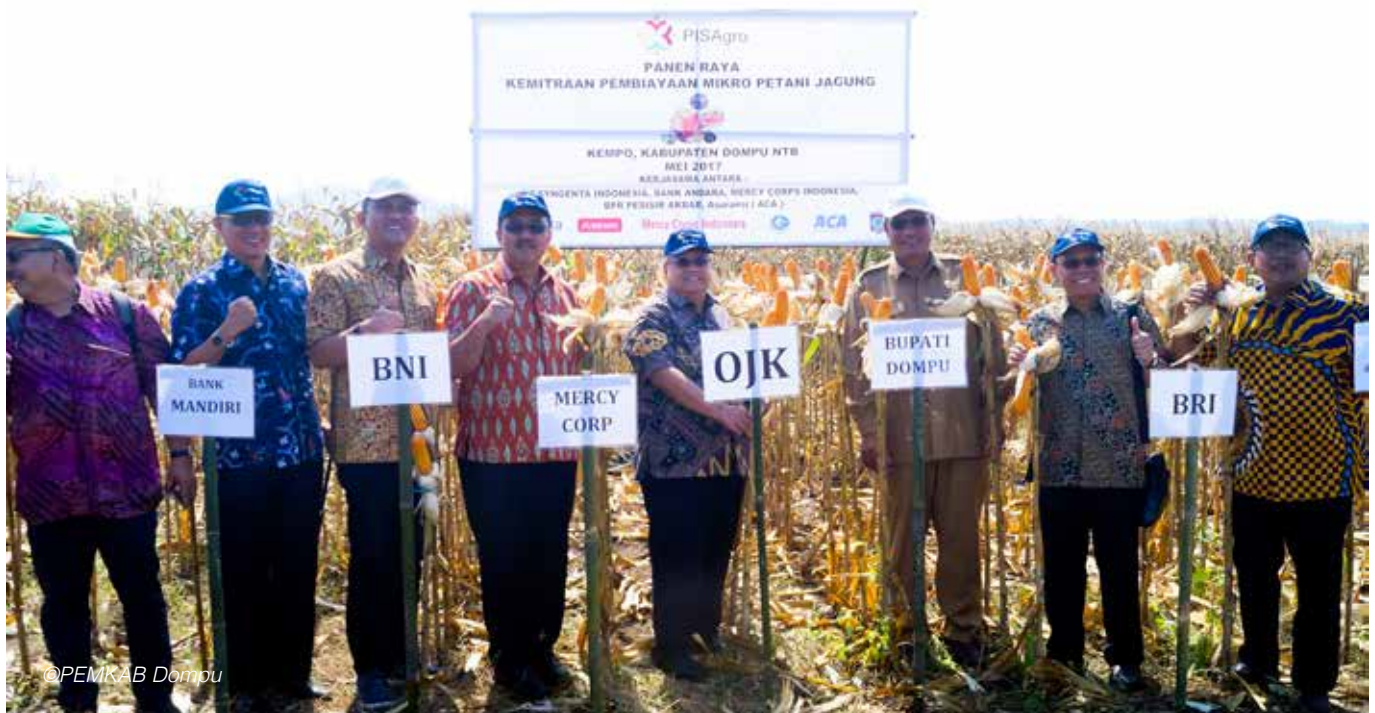
OJK's AKSI PANGAN program in Dompu.

The Indonesia Financial Services Authority (OJK) launched the AKSI Pangan Program on 24 March 2017. The name “AKSI Pangan” is an Indonesian acronym for “Acceleration, Synergy and Financial Inclusion in Food”. It is expected that the AKSI Pangan Program will become a national movement to introduce and implement a value chain financing scheme to accelerate financial access and increase financing to the food sector, specifically for eleven food commodities including rice, corn, soybeans, and sugar cane.